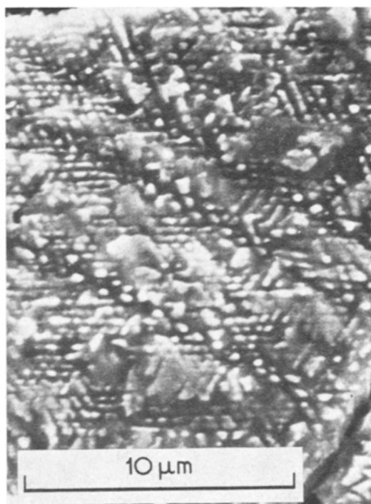
Figure 2 SEM micrograph of the surface of long-range ordered \beta(\text{Ni}_4\text{Mo}) after exposure to HBr for 16 h. Regular corrosion pattern can be seen.